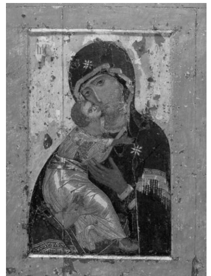
The Virgin of Vladimir, Russian