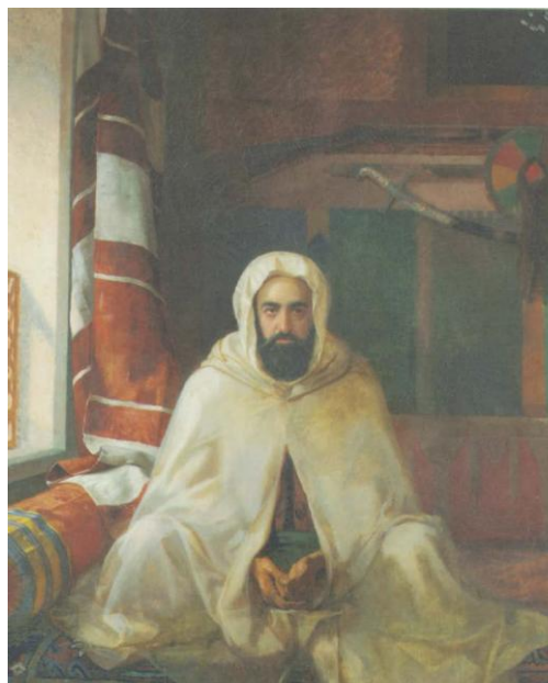
Portrait of Abd el-Kader in Istanbul, by Stanislaw Chlebowski,