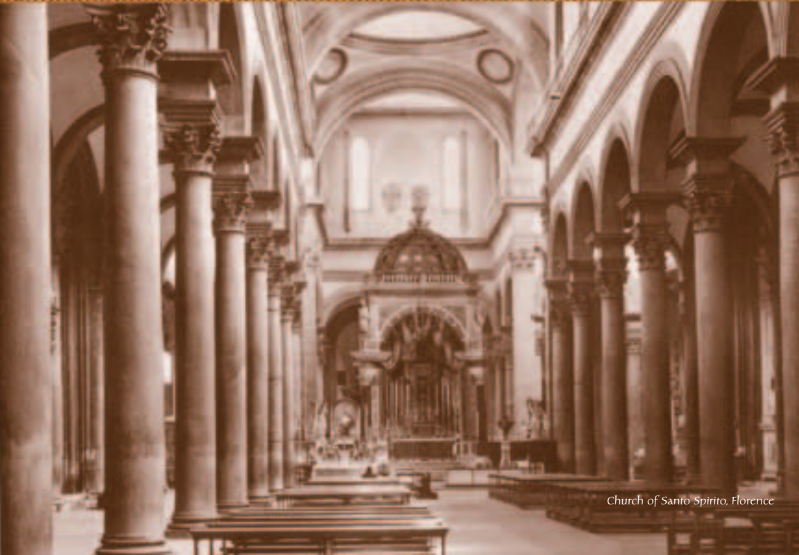
Church of Santo Spirito, Florence