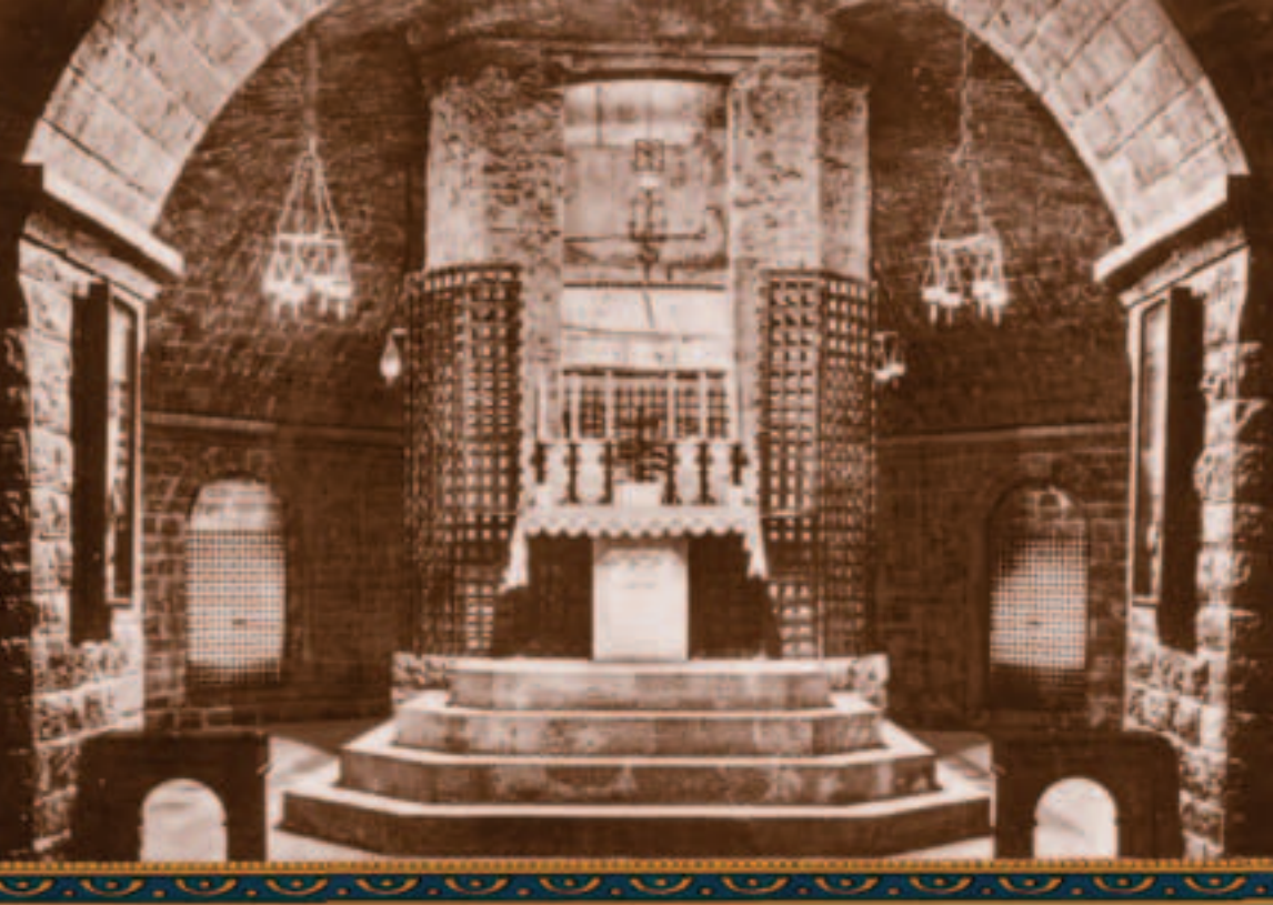
St. Francis' Tomb, Assisi

raised be my Lord for our sister, the death of the body, From whom no man escapeth.