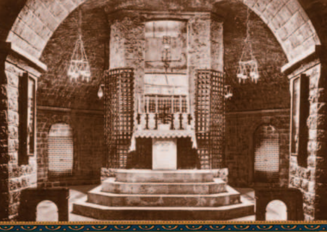
St. Francis' Tomb, Assisi

raised be my Lord for our sister, the death of the body, From whom no man escapeth.