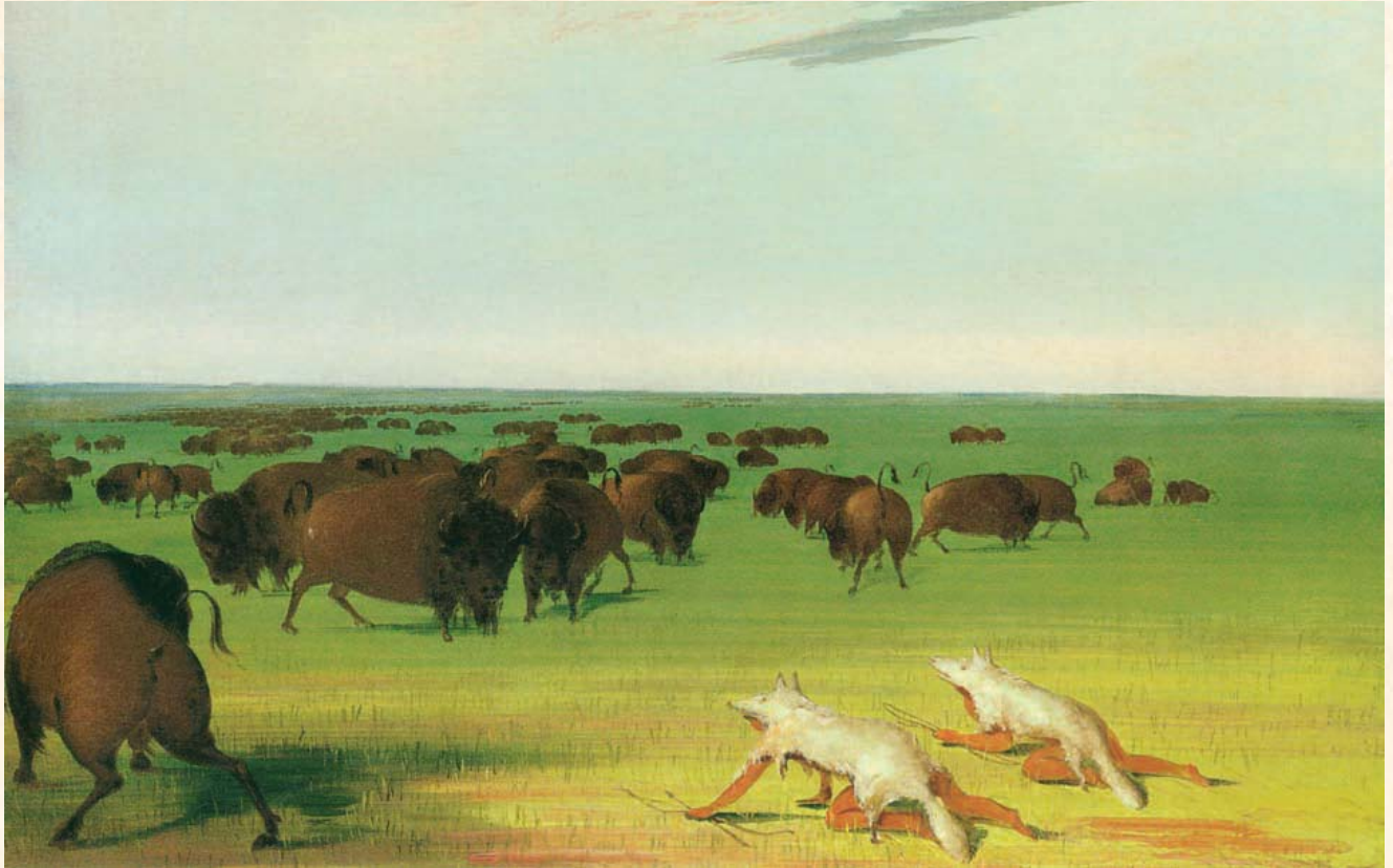
George Catlin, Buffalo Hunt under the Wolf-Skin Mask

dian was a scout; but there were some especially appointed to serve for a certain length of time. An Indian might hunt every day, besides the regularly organized hunt; but he was liable to punishment at any time. If he could kill a solitary buffalo or deer without disturbing the herd, it was allowed. He might also hunt small game.