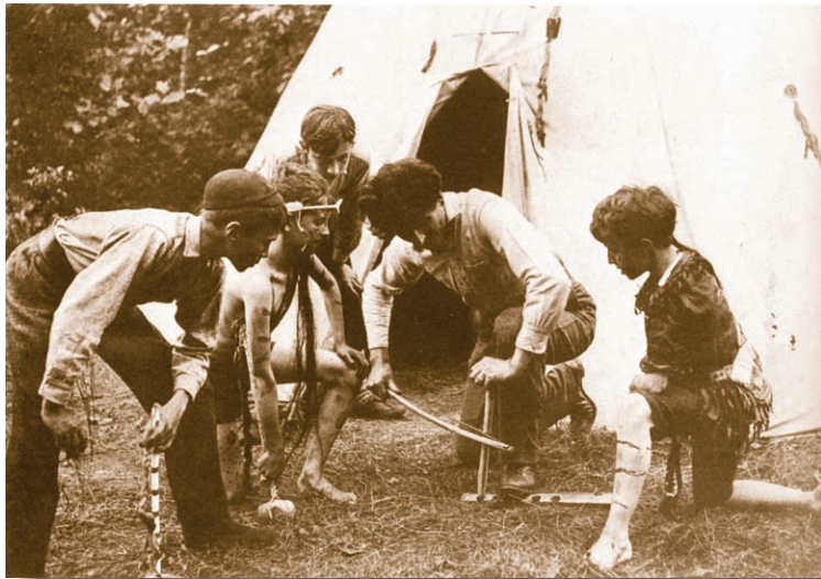
Seton teaching fire-making, 1903